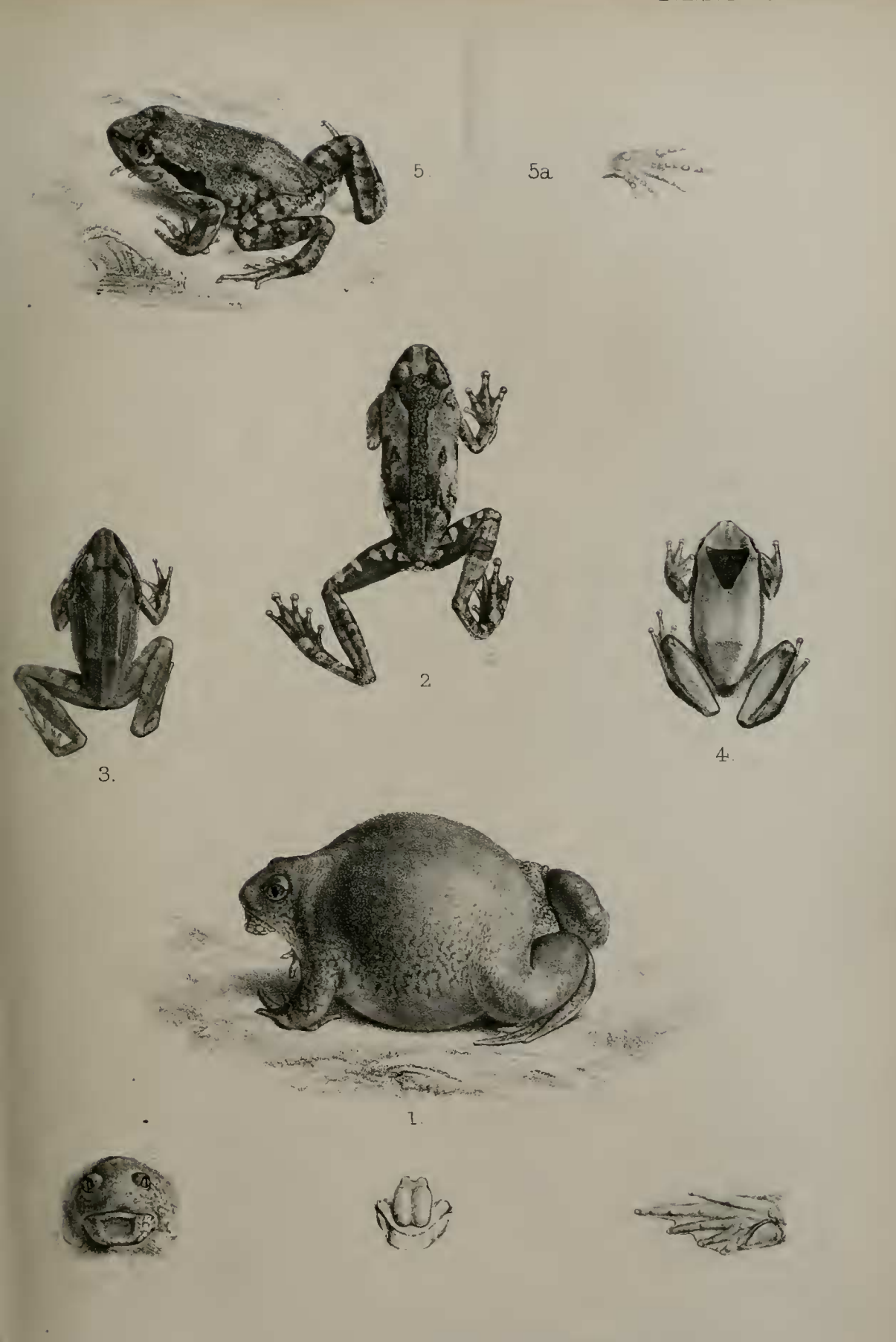
1 Glyphoglossus molossus. 2.Hyla dasynotus. 3.Hylodes sallæi. 4.Hyla triangulum. 5.Cacotus maculatus